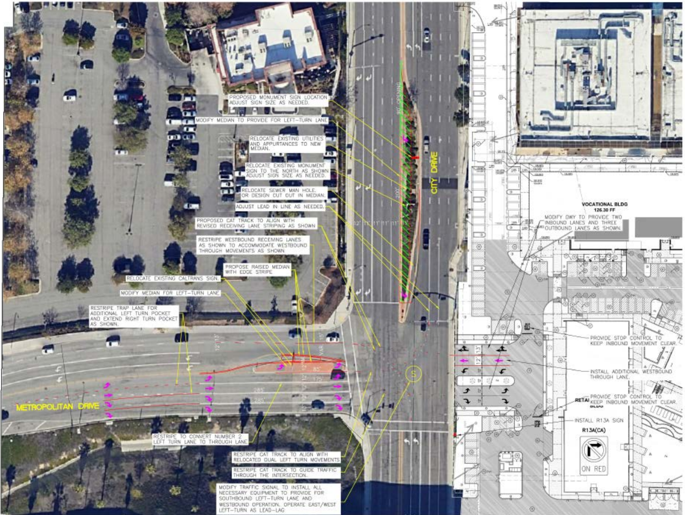
EXHIBIT A Project Location and Boundaries